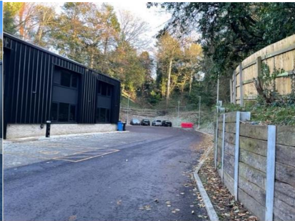
Looking West towards the rear of the site