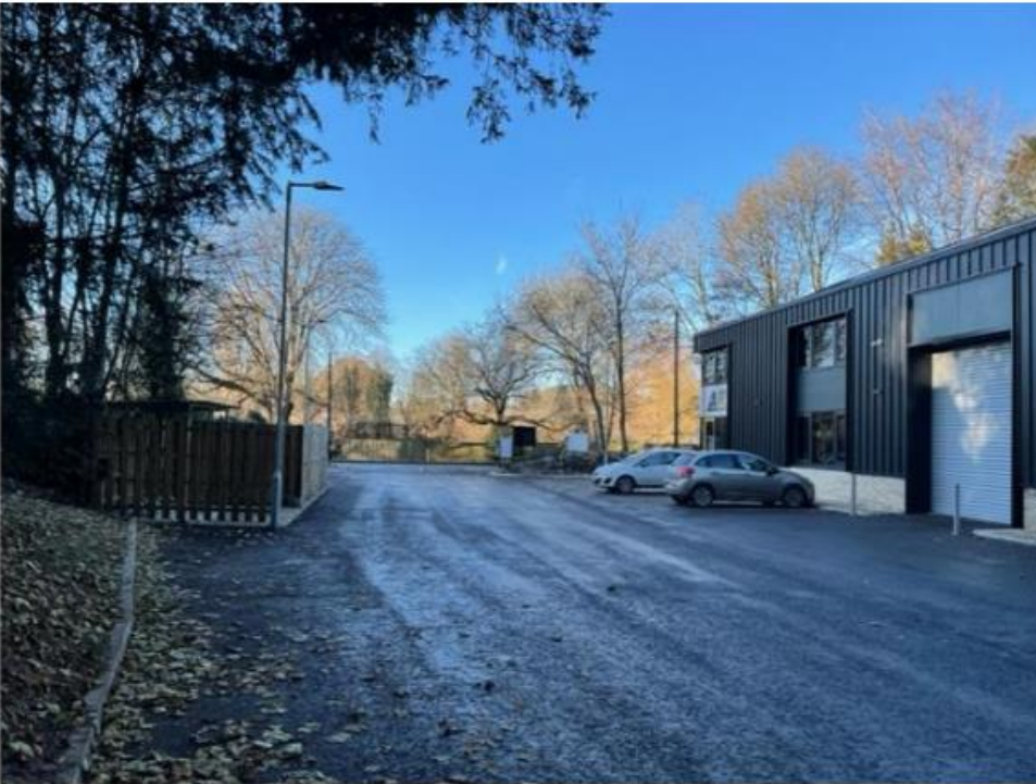
Looking East to site access