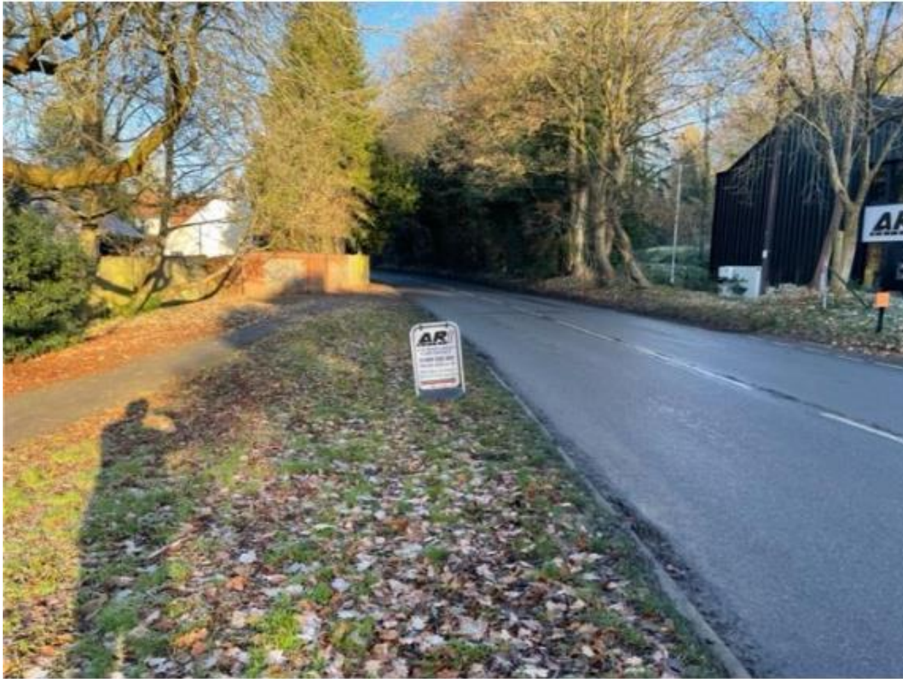
Opposite access looking North along Lower Lane