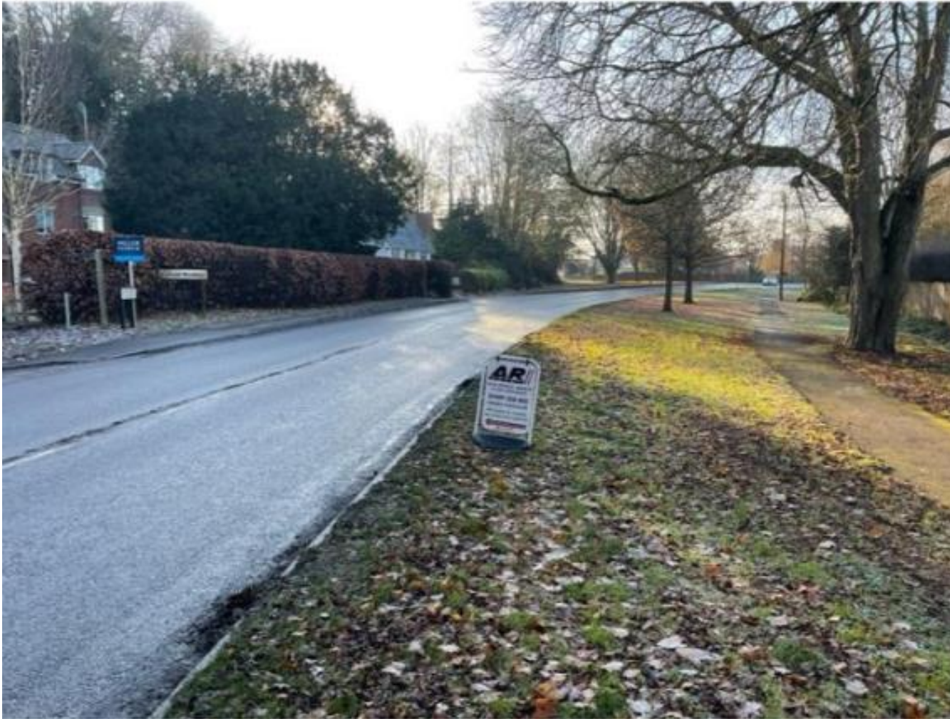
Opposite access looking South along Lower Lane